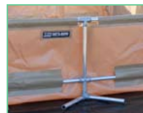
32" Wall Height