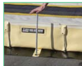
Eyelet patches for staking down berm and optional High Wind Stakes