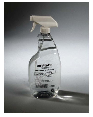
32-oz Empty Sprayer Dilution Bottle (Case of 12) #D506CS